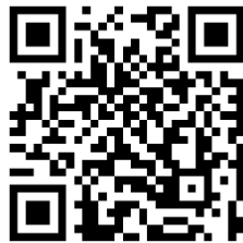
Lenoir Dining Hall to Morehead Planetarium

For those wishing to walk to Morehead Planetarium, please meet in The Pit outside of Top of Lenoir at 6:15PM. Our staff will guide you there with the final guided departure leaving at 6:25PM. To return to Rams Head parking deck after the show, please follow walking directions with QR code below.